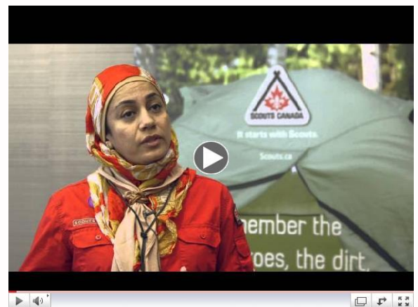
Canadian Path Testimonial