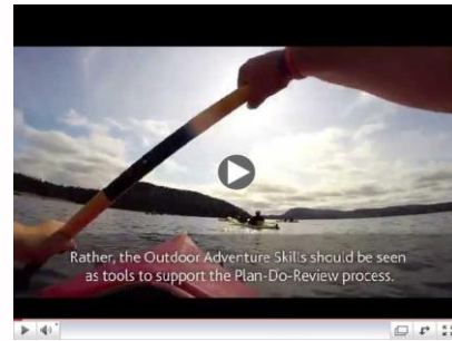
Outdoor Adventure Skills